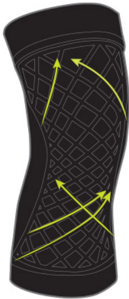
Embedded kinesio tape design enhances compression over targeted areas